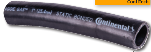
Supplied with anti-static wire which must be grounded to couplings.

Temperature Range: -37°C (-35°F) to +82°C (180°F)